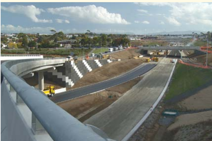
BOTTOM LEFT: VIEW FROM FLYOVER TOP RIGHT: MANUKAU RAIL STATION

A plan to make it easier to get to and from Botany Town Centre has won a major planning award in May this year. The Botany Town Centre Travel Plan, which is the first of its kind in New Zealand, has won the New Zealand Planning Institute's Best Practice Award. The travel plan is primarily aimed at making it easier for people to travel to work at the town centre without always relying on the car. Shoppers will also benefit from some of the initiatives. The plan was developed by Manukau City Council, Opus and Botany Town Centre owners AMP Capital Investors.